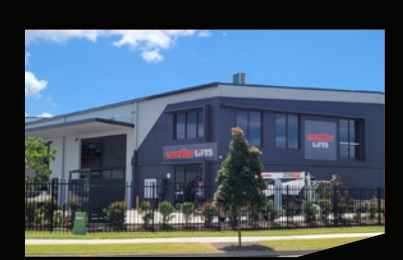
Brisbane - Caboolture