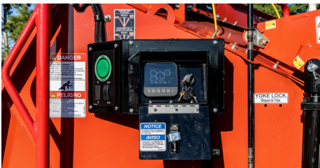
Infeed-Mounted Control Panel